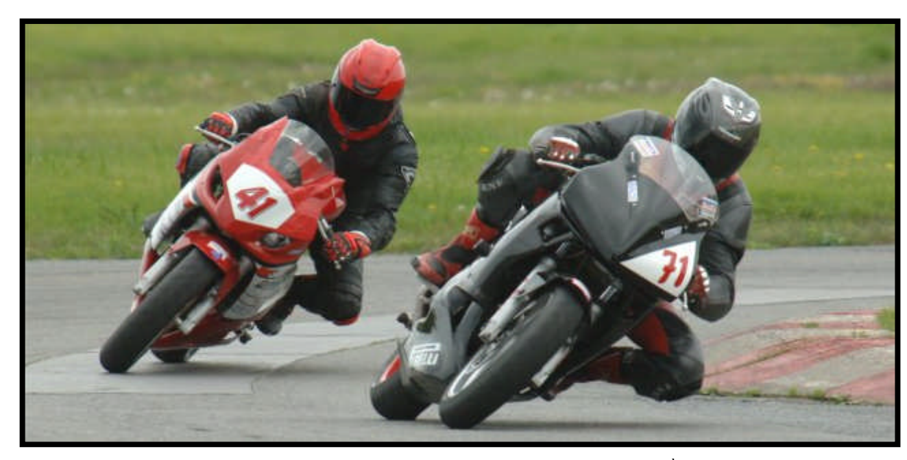
Caption: Round #5 - Same corner I'd crashed during Round #3, Aug. 3<sup>rd</sup>, 2007

RACE SuperSeries Round #6 September 28, 29 & 30 2007